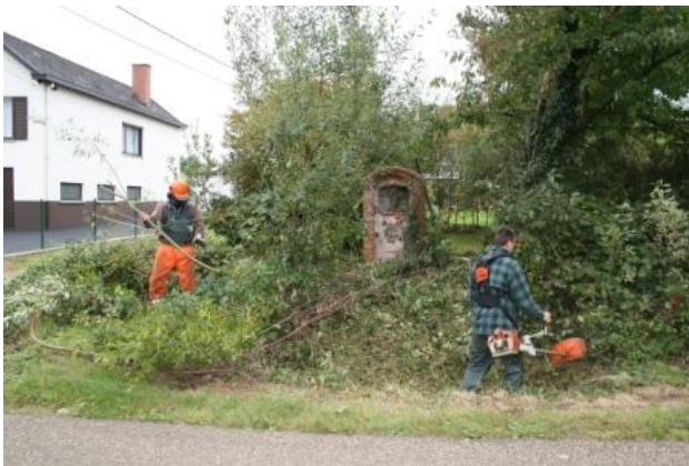
Figure 3. Example of maintenance activities.

The IPO posed three key questions for these three aspects: