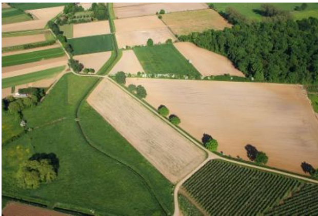
Figure 1. Paths, hedges and trees: examples of different elements of landscape management.