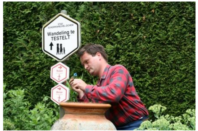
Figure 2. Signage: an example of an element of recreational infrastructure.