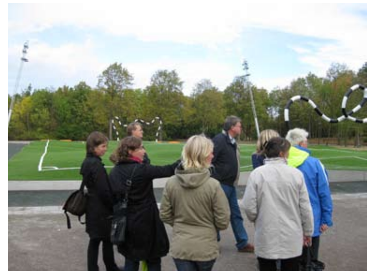
Study trip to case study "Theme playgrounds in Malmö". On site presentation with the City of Malmö staff, Sep 2009

In December 2009 a detailed planning and scheduling of the investments is about to start.