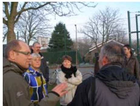
Joint planning workshop Bruges, Dec 2009